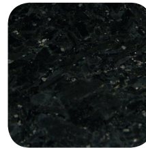
40-6032-07 Cambrian black