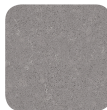
52-6032-HRU609 Uptown Grey