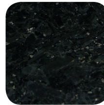
42-6036-07 Cambrian black