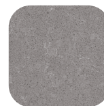
50-6030-HRU609 Uptown Grey