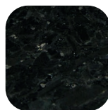
40-6030-07 Cambrian black